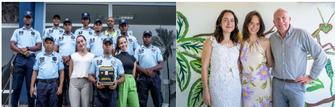
Handover of AEDs in November 2024

In addition to the donation, training sessions were conducted for the police officers and hospital personnel, ensuring they were fully equipped to use the AEDs and perform CPR in emergency situations. The highlight of this visit was the hand-over ceremony, which provided a valuable opportunity for all involved parties to come together, celebrate the progress made, and strengthen the collaboration between the Nova Onda foundation, local authorities, and the local community.