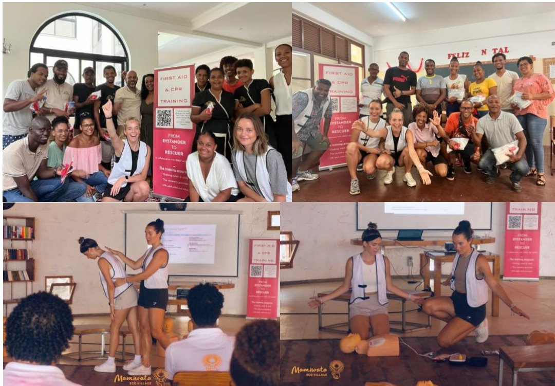
Some impressions from training sessions